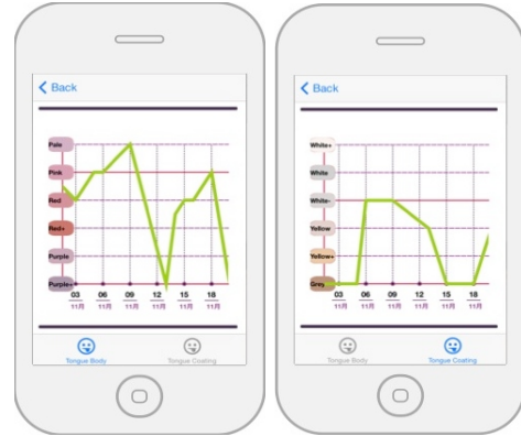
Figure 3: The tongue body (left) and coating (right) color graph reflecting health condition.

unstable. In her health condition diary, it referred that her digestive system was in trouble in that day because of overeating and over stress, and felt uncomfortable after that day. Therefore, we think our tongue color graph could give users and doctors some useful reference value in physical health inspection. As further feasibility test, we are asking 20s collage students to use the TongueDx application.